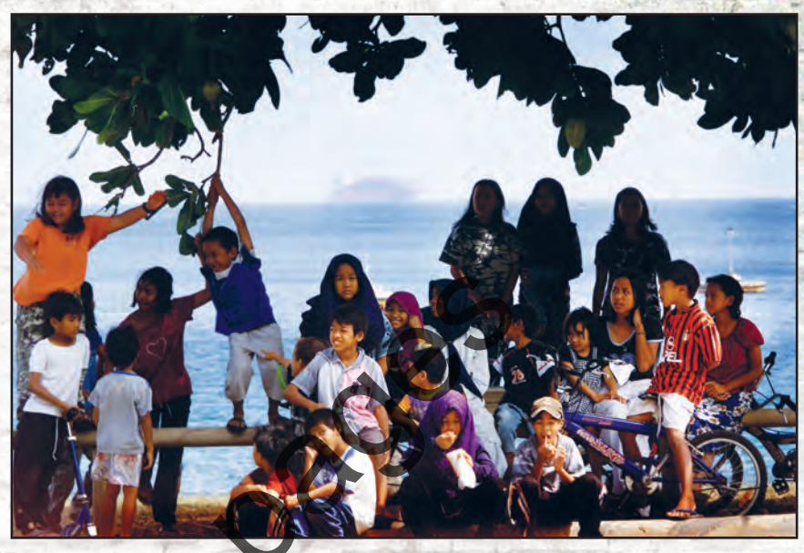
Newly arrived refugees at Christmas Island, Australia

Refugees are people who have been forced to flee their home country due to a fear of being maltreated because of their race, political beliefs or social standing if they remain in or return to their country. As well as refugees, there are millions of other people who are of concern to the United Nations Refugee Agency. These include asylum-seekers (people hoping to find protection in another country), returned refugees and Internally Displaced People